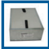
F475 Medical Grade HEPA Filter 99.995%