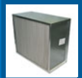
F052 HEPA Filter