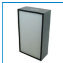
99.97% HEPA Filter F057