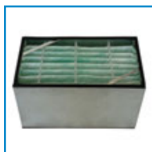
12" Deep Pleat Filter F015