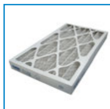
2" Pleated Filter F007