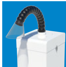
CAPTURE ARMS AVAILABLE

3087792 CONFORMS TO: UL STD 507 CERTIFIED TO: CSA STD C22.2 NO 113