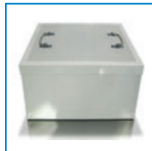
12" Carbon Filter AG098