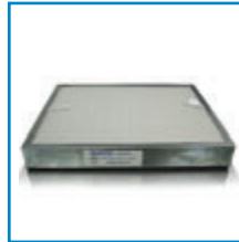
2" HEPA Filter F074