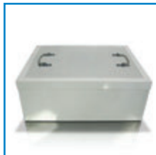
8" Carbon Filter AG097