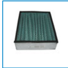
4" High Capacity Filter F164