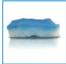
Knock-out Pad AG168