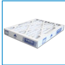
2" Pleated Filter F071