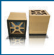
AG162 Box Filter