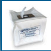
AG321 Bag Filter