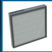
F230 HEPA Filter