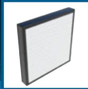
F229 Chemical Filter