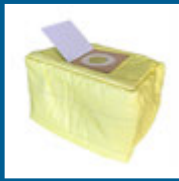
AG320 Bag Filter