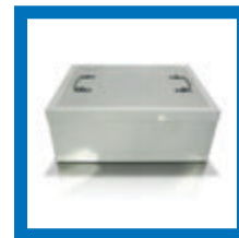
AG097 Chemical Filter