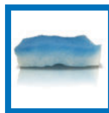
AG168 Knock-out Pad