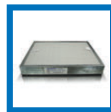
F074 Medical Grade HEPA